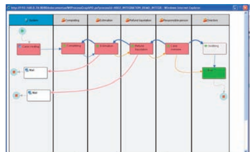
selected process overview