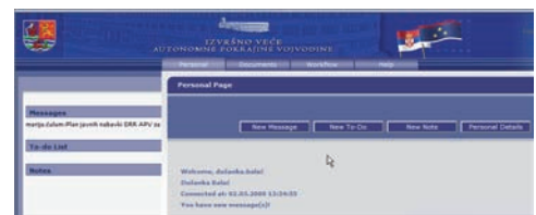
UI for the provincial government of Vojvodina